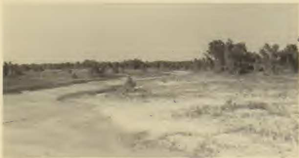
FIG. 4.—Rita Blanca Creek west of Channing, Hartley County.